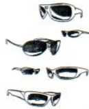
unas gafas de sol