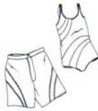
un traje de baño