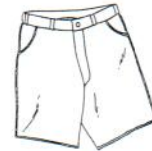
unos pantalones cortos

Practice all of the different clothing words you have learned. Cut out from old magazines pictures of different clothing. Then mix and match what you have cut out to create silly outfits. See who can create the silliest one! To win, you have to be able to name all of the clothing in your silly outfit—in Spanish!