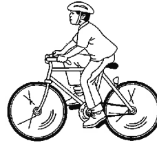
andar en bicicleta