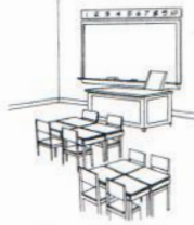
el salón de clases