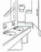
el cuarto de baño