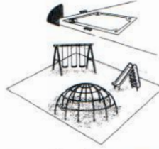
el patio de recreo