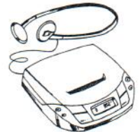
el lector de discos compactos

Cover up the words and point to each picture to see if your parents or guardians can name each fun thing. Then have them cover up the words and point to each picture to see if you can name each fun thing, too!