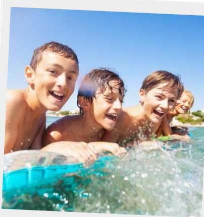
Creating lifelong friendships