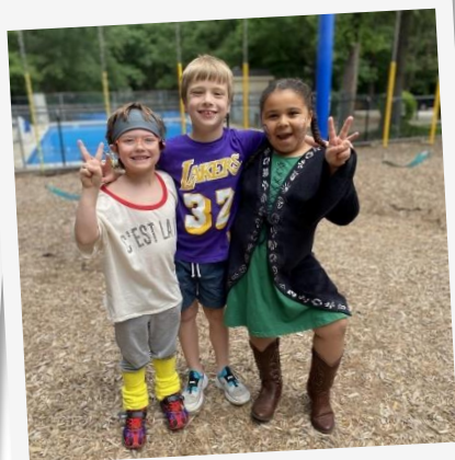
Creating Lifelong Friendships