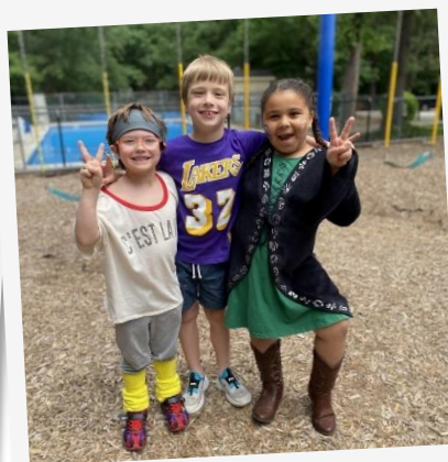
Creating Lifelong Friendships