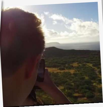
Expand your horizons