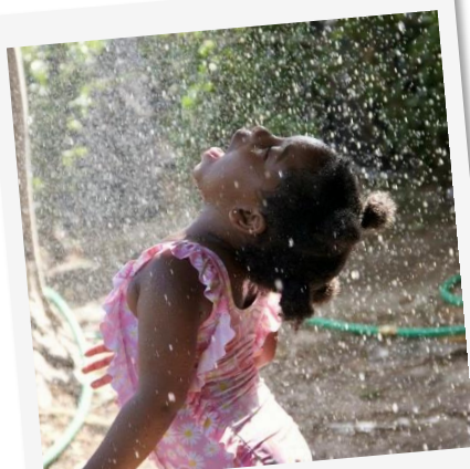
Carefree Summer Bliss

Apply sunscreen to your child prior to coming to camp and provide a hat they may wear during outside play time (please label the hat with your child's name).