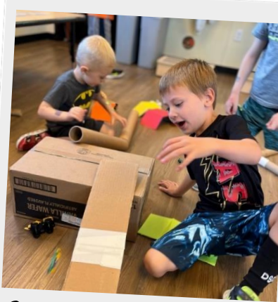
Sculpting Imagination into Reality