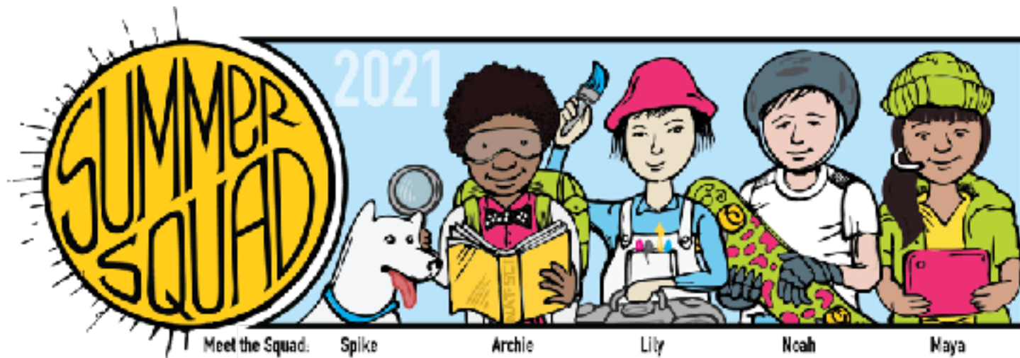
Meet the Squad: