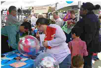
Samples & Demos