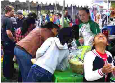
Hundreds of Products