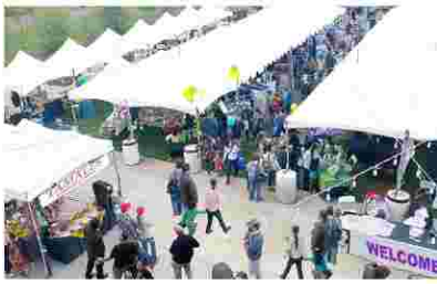
Plenty of Vendors