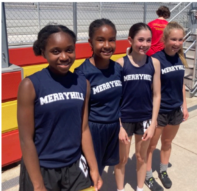
Midtown's JV Girls 4x100m record breakers!